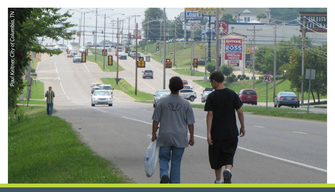
People walk in the grass alongside rapidly moving traffic on James Campbell Blvd in Columbia, TN, a road slated to receive improvements due to the MPO's prioritization process.

The MPO is funding complete streets improvements in the City of Columbia, TN (population approx. 35,000), seen in the image below of James Campbell Blvd. The project will provide a multi-use path on the north side of the street and a sidewalk on the south side. Since the project will serve census block groups with higher rates of five characteristics identified with underserved and vulnerable populations, it received eight out of eleven possible "health equity" points in the MPO's 100-point scoring system.