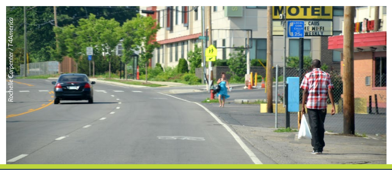
People navigate a section of Dickerson Pike that lacks sidewalks, curbs and other basic infrastructure to make walking safe and convenient.

The MPO's most recent long-range transportation plan directed funding to sidewalks and other improvements along many corridors. Planned complete streets improvements along Dickerson Pike, pictured below, received the full 11 out of 11 "health equity" points in the MPO's scoring process for the long-range transportation plan.